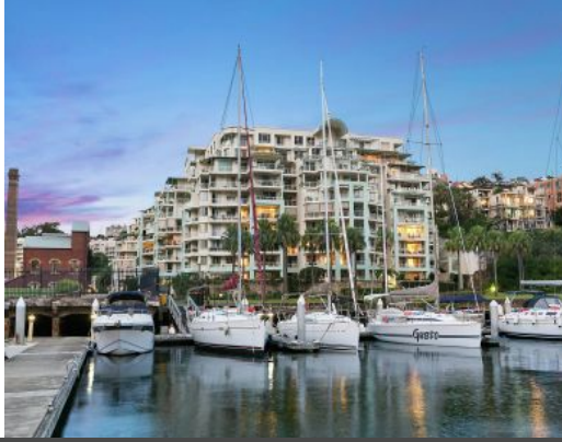
1c/22 Ross Street Waverton, NSW