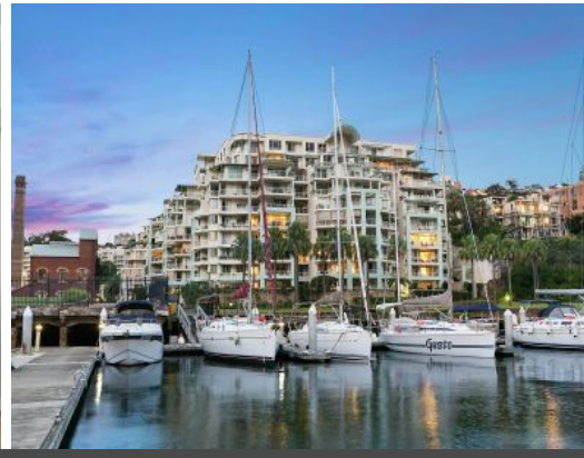
1c/22 Ross Street Waverton, NSW