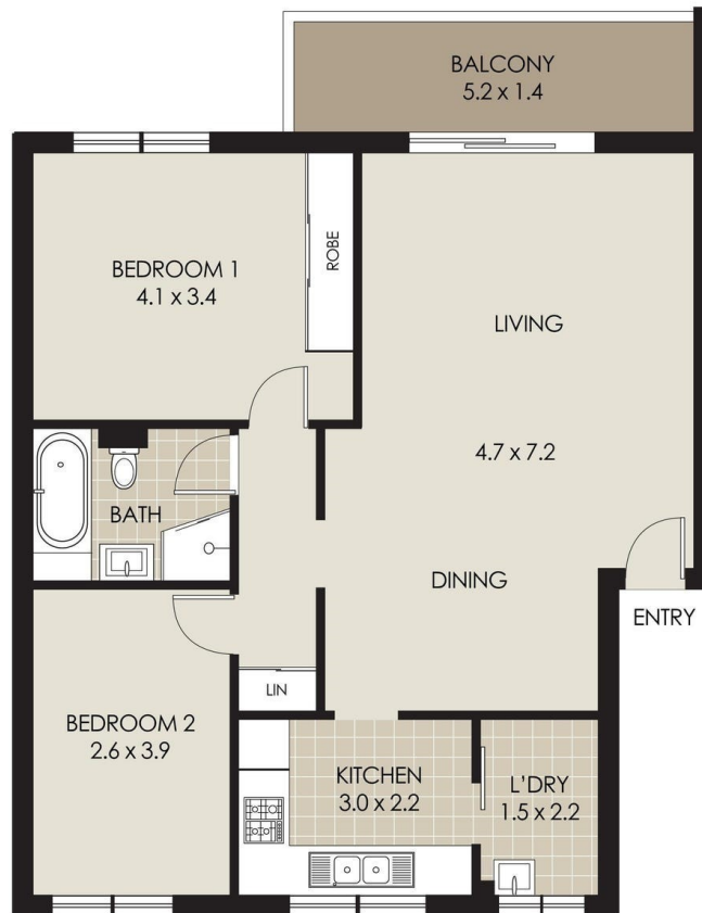
APARTMENT FLOOR PLAN